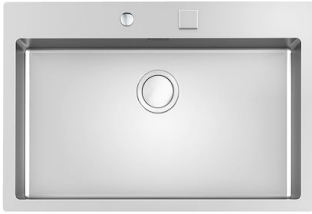
Sink S4001 Filotop 3366 050